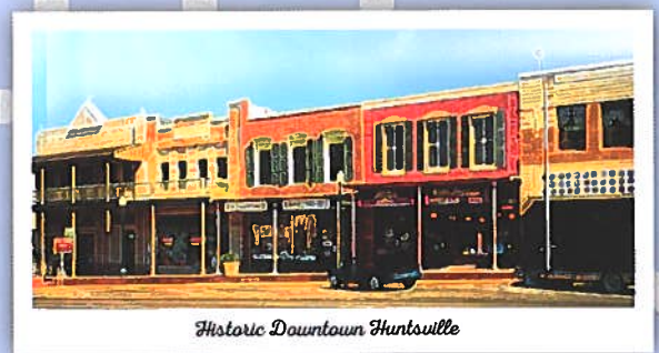
Historic Downtown Huntsville

Within a nine-block radius in the heart of our beautiful city lies the historic square. Here you will find an abundance of retail and antique shops with great gift ideas for friends and family, or for your own pleasure.